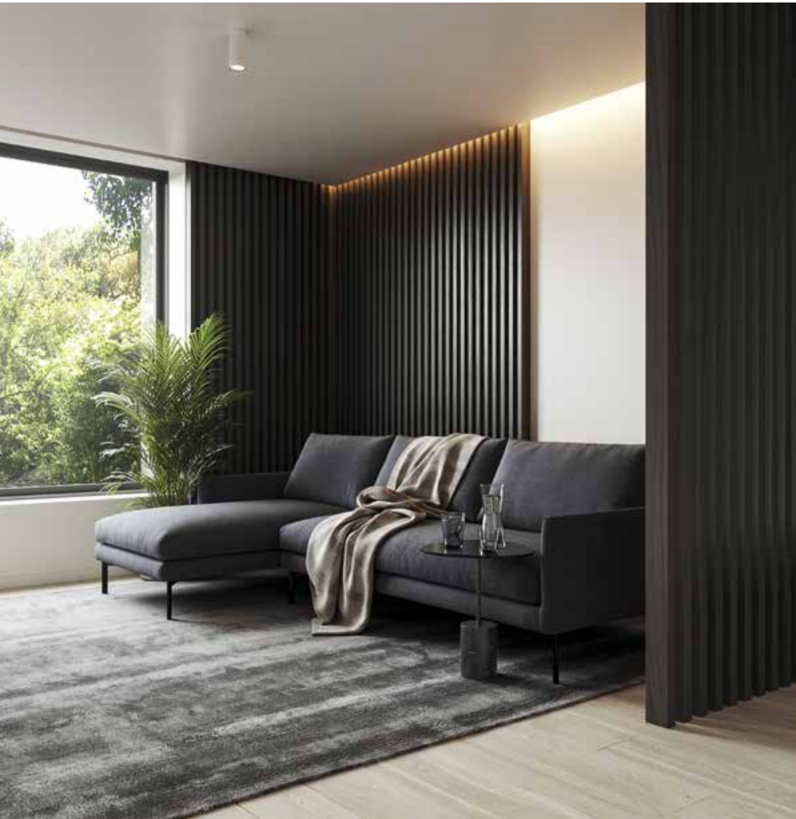
Unfinished Natural Oak - finished with darkbrown wood oil