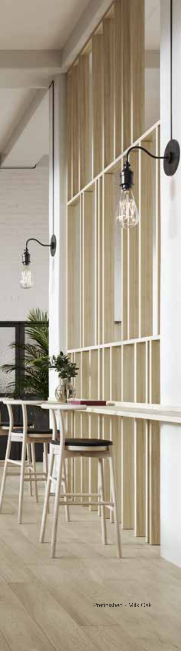
Prefinished - Milk Oak

Astrata slats, an elegant, easy-to-use room divider