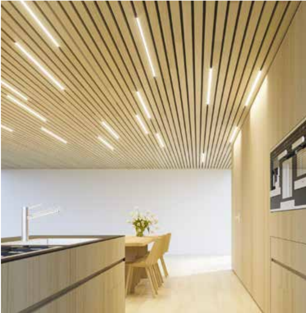
Prefinished - Ivory Oak

Astrata slats, the veneered solution for your decorative wall and ceiling coverings