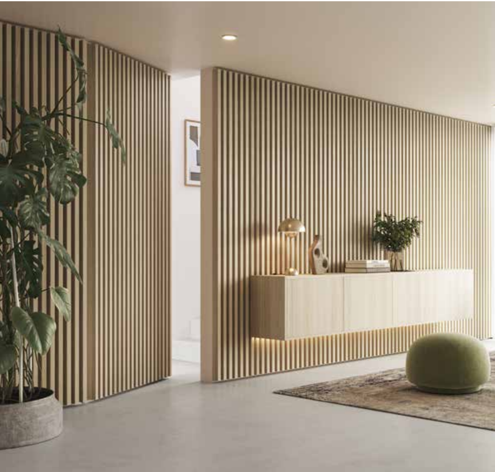
Prefinished Ivory Oak