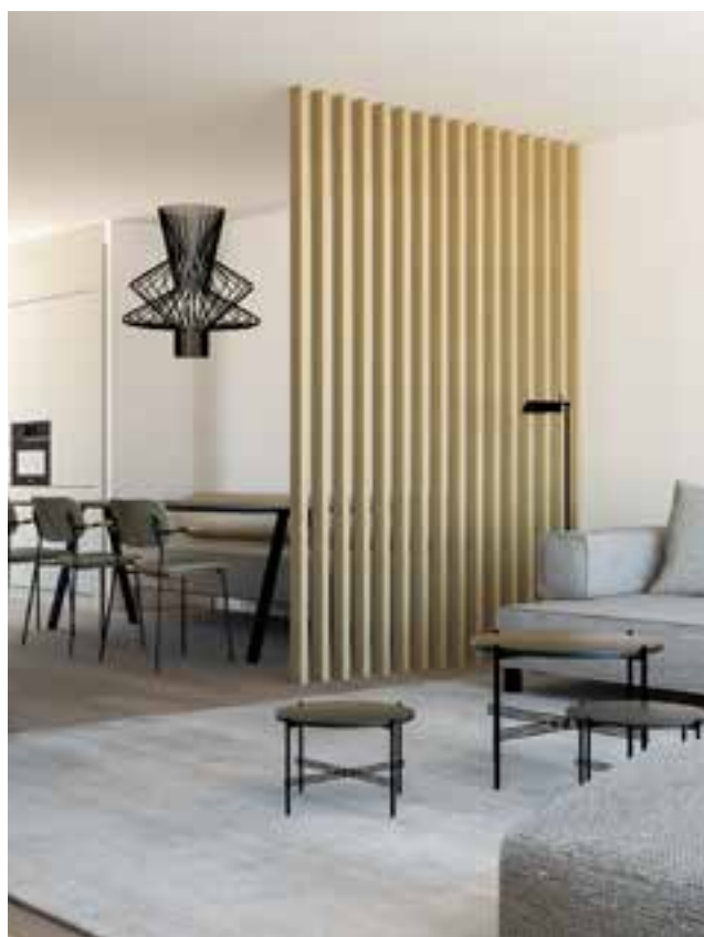
Prefinished - Ivory Oak

Astrata slats, an elegant, easy-to-use room divider